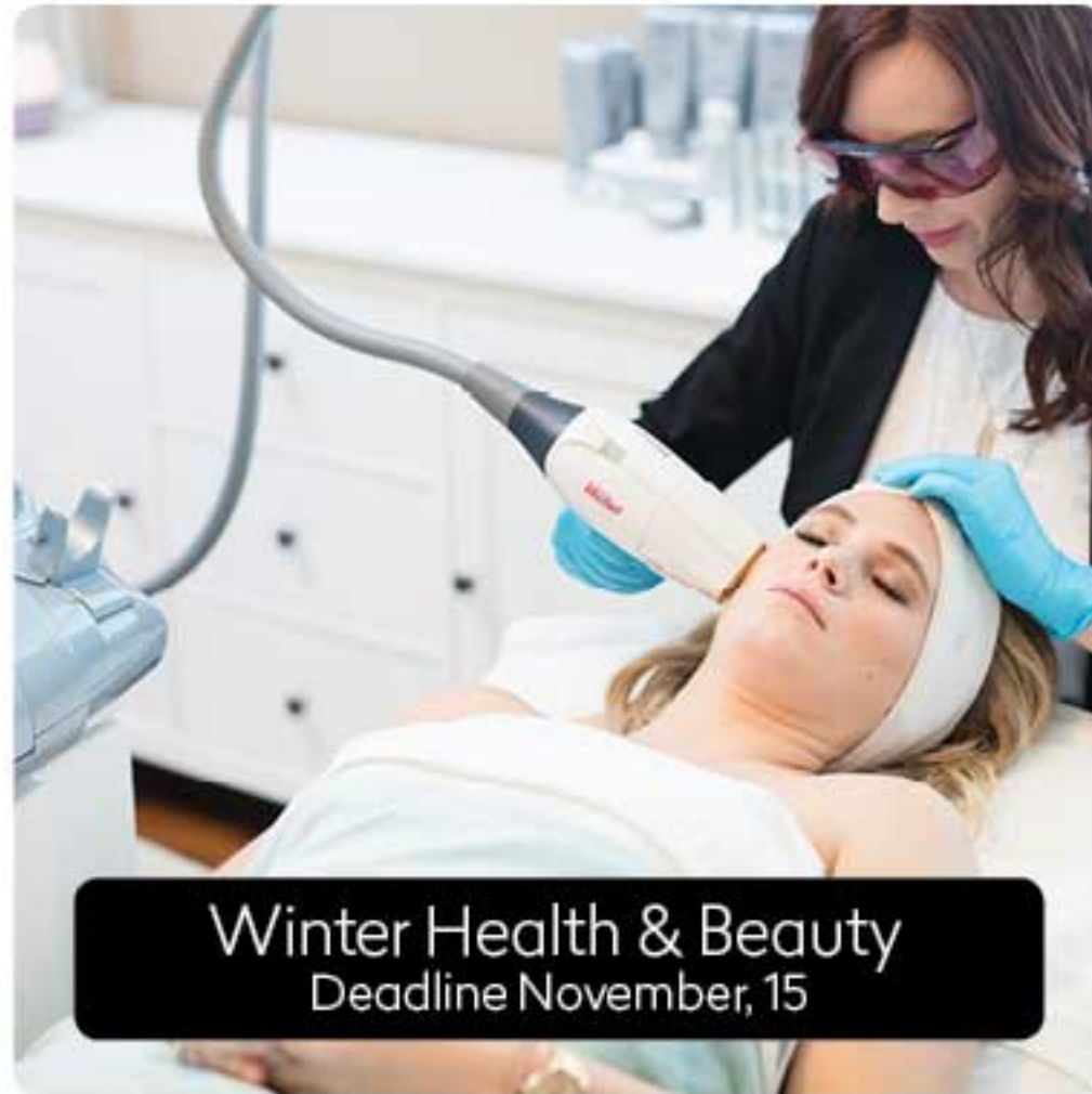
Winter Health & Beauty Deadline November, 15