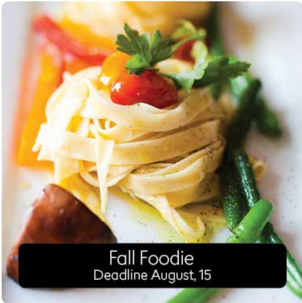
Fall Foodie Deadline August, 15