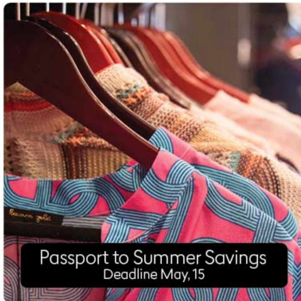
Passport to Summer Savings Deadline May, 15